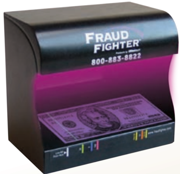
With Fraud Fighter™ Verification